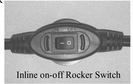
Inline on-off Rocker Switch